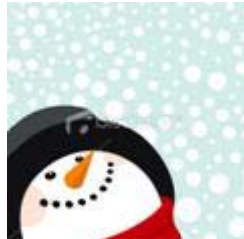
Let it Snow, Let it Snow, Let it Snow

The MSA Handbook says (p.12), "In case severe winter weather forces us to close the school, such notices will be given on the school voicemail system, via your homeroom advisor and on the following radio/TV stations: