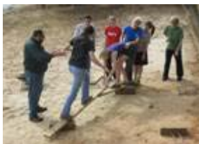
This is the "Acid River" exercise

Mill Springs Academy 13660 New Providence Rd Alpharetta, GA 30004 770-360-1336