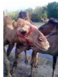
Up close and personal with the Camel