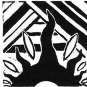
Design by Amy Karschner Upper School

It's "Style'n Time" again...and just what you've been waiting for. Our new T-shirt designs and colors are available to add power to your "Style'n" wardrobe. This year we've also included both adult and youth long sleeve T-shirts in a great selection of sizes and colors. They're awesome!